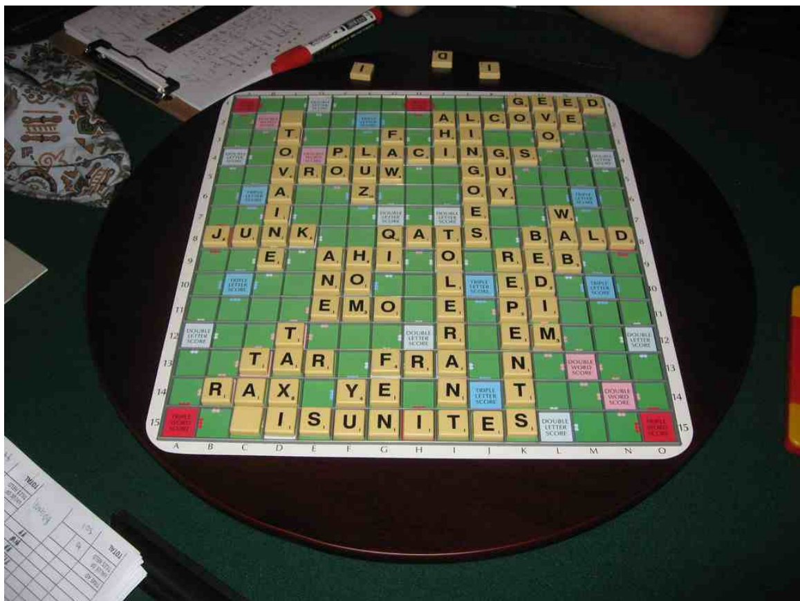
Figure 4: Final board position for the game against Kitty-Jean Laginha

Round 14: This was a fantastic high scoring game with Aussie Kitty - Jean Laginha. I started with a bonus LINGOES, but Kitty replied with PLACINGS. We again traded bonuses on move 6 and late in the game. With some clunky consonants on my rack, I was thankful to be able to play JUNK for 60 on the triple. Some copious tile tracking allowed me to seal the game 511-470.