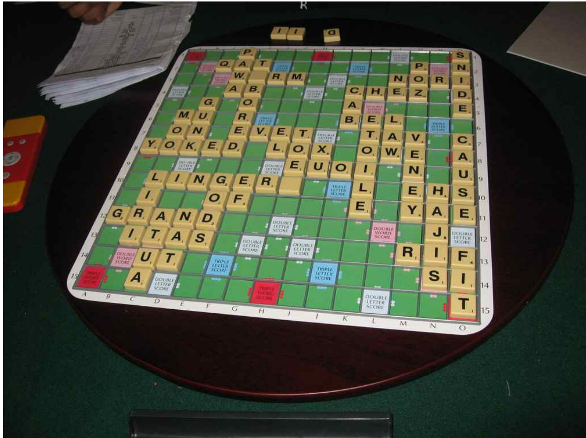
Figure 5: Final board position for the game against Jessica Pratesi (UK)

Results: Bharadwaj 377 defeated Jessica Pratesi (GREAT BRITAIN) 355.