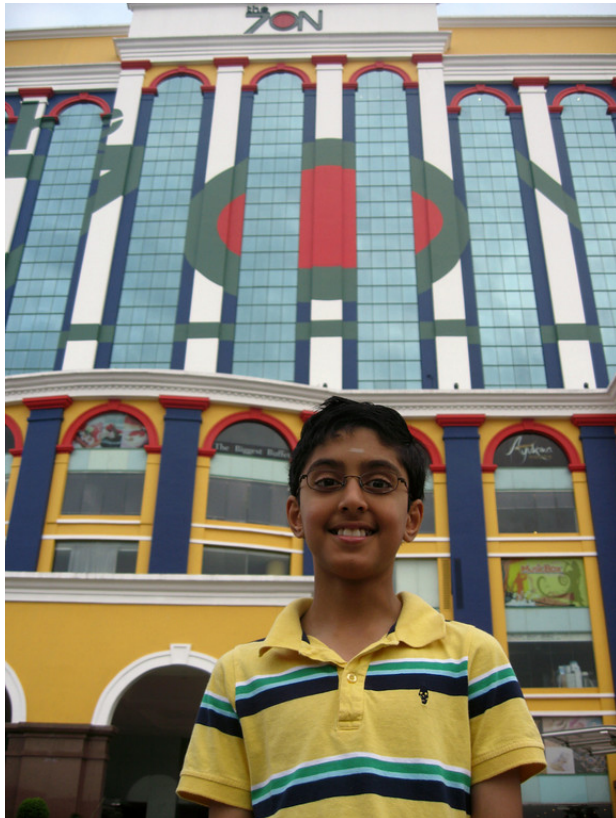
Figure 1: I am standing in front of Zon Regency hotel where the tournament was held

Introduction: I had come to the same place in 2009 for a previous WYSC finishing 28 th out of 81 contestants. My goal was to finish in the top five this year and show that I had definitely improved my game since 2009.