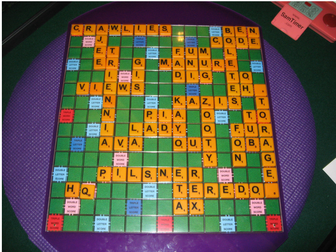
Figure 2: My final board position for the game against Cheong Yi Wei from Malaysia

Results: Bharadwaj 451 lost to Cheong Yi Wei (MALAYSIA) 503.